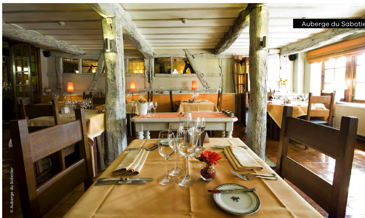
Auberge du Sabotier

Laneuville-au-Bois 36A 6970 Laneuville-au-Bois (Tenneville) lestrappeurs.be